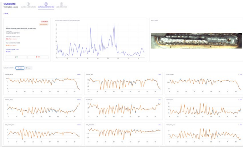
Fig. 1.: Detailed multimodal exploration interface for time series and visual data

Type of project: VIVARIUM II, multi-firm